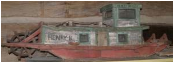
52" Long sternwheeler "Henry Bailey"