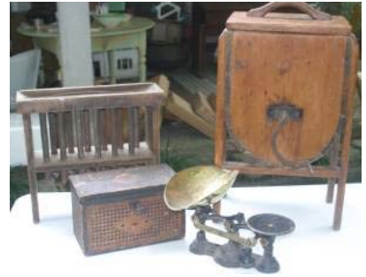
Candle mold, early scales, boxes, wrought iron, cast iron molds, pewter candle sticks and lots more.